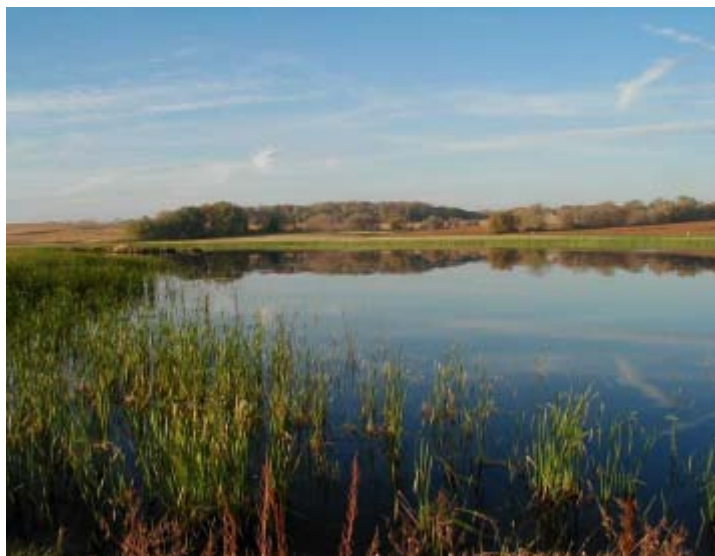
Wetland located in Eureka Township

As people understand ecological processes better, attitudes towards wetlands change. We now know that wetlands are, in fact, valuable natural resources. Whether drier or wetter, bigger or smaller, wetlands provide important benefits to people and the environment. Wetlands help regulate water levels within watersheds; improve water quality; reduce flood and storm damages; provide important fish and wildlife habitat; and support hunting, fishing, and other recreational activities. Wetlands are natural wonderlands of great value.