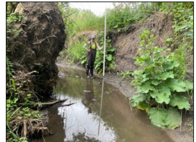
Site 3 – Eroding banks near Valley Park playground