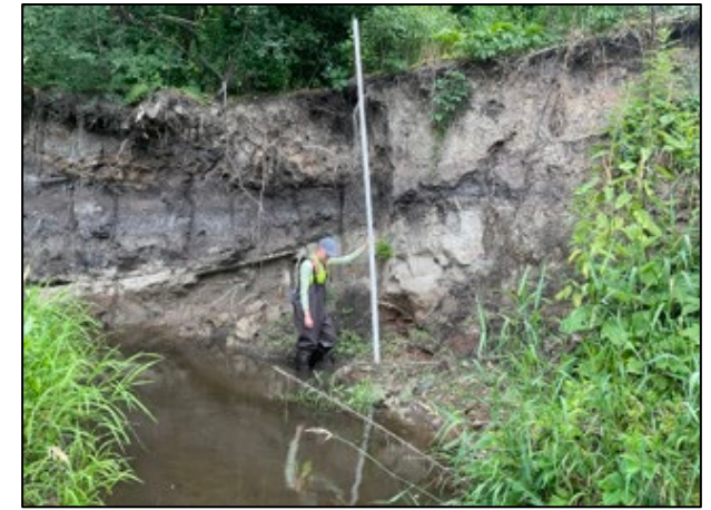
Site 1 – Eroding banks up to 14 feet in height